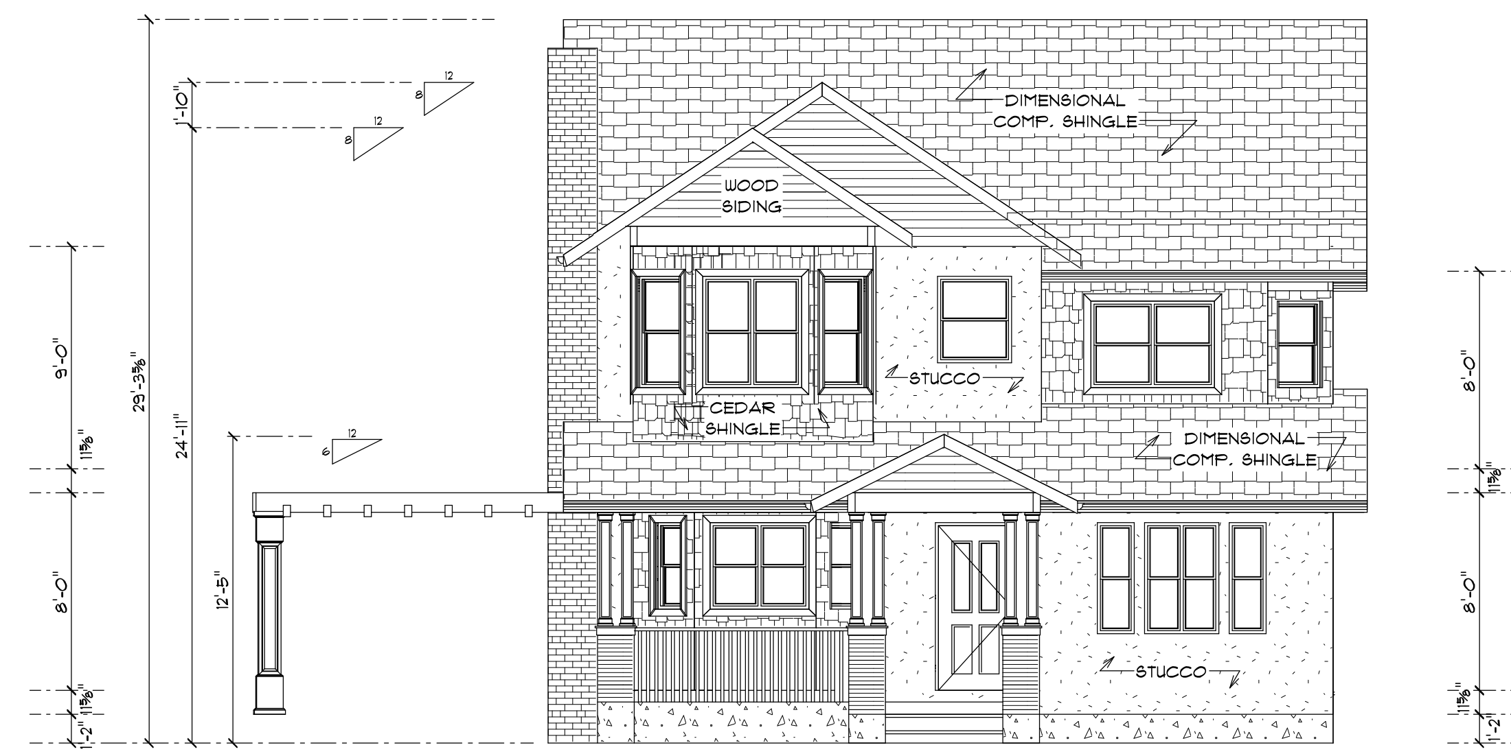
WEST ELEVATION SCALE: 3/16" = 1'-0"