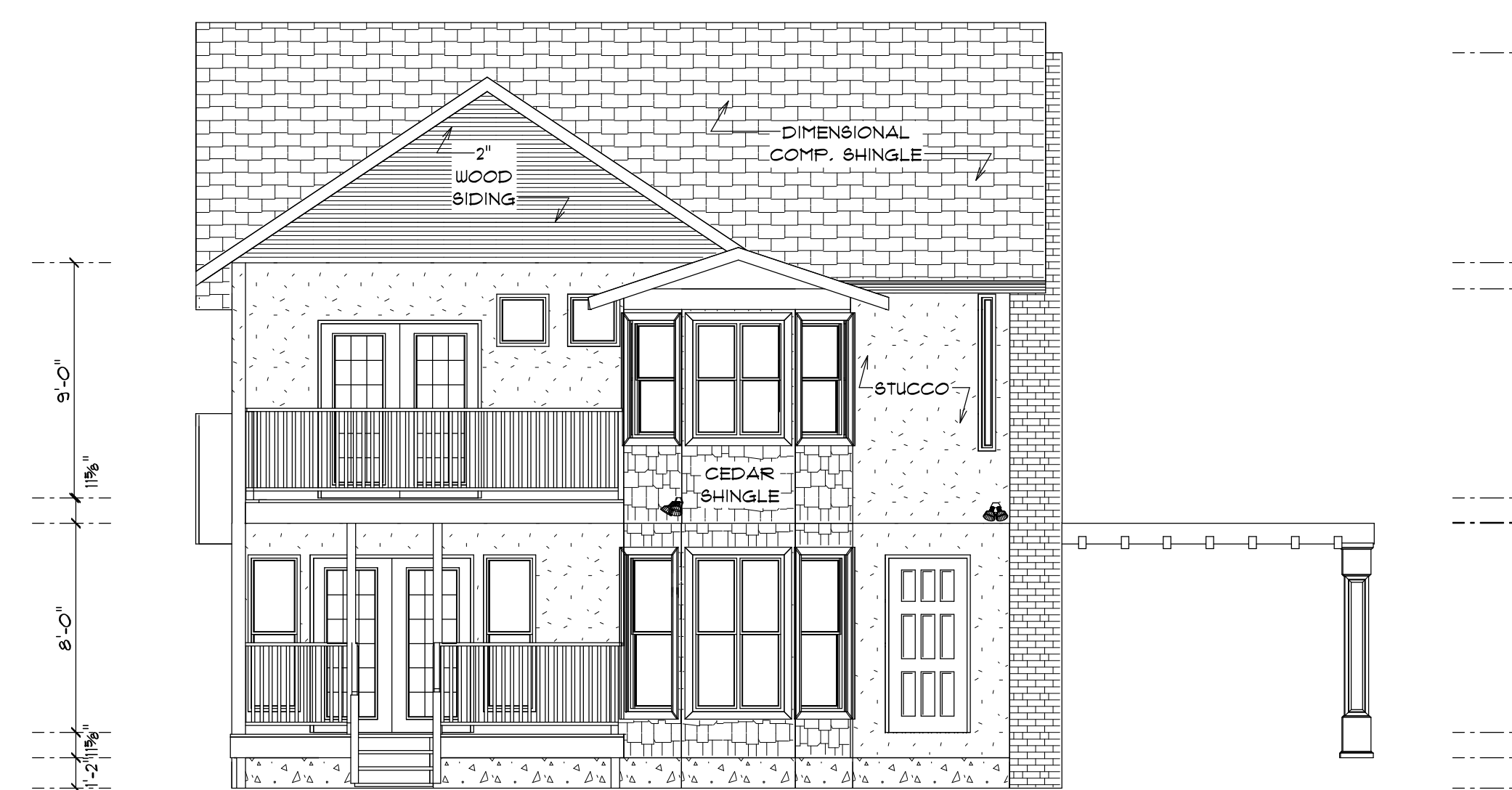
EAST ELEVATION SCALE: 3/16" = 1'-0"