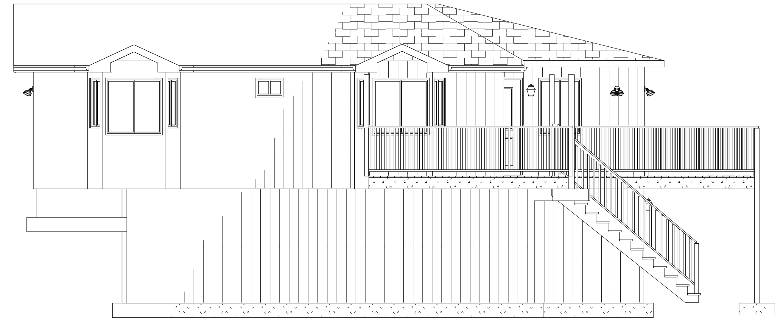
WEST ELEVATION SCALE: 1/4" = 1'-0"

PRELIMINARY ELEVATIONS EXISTING RESIDENCE