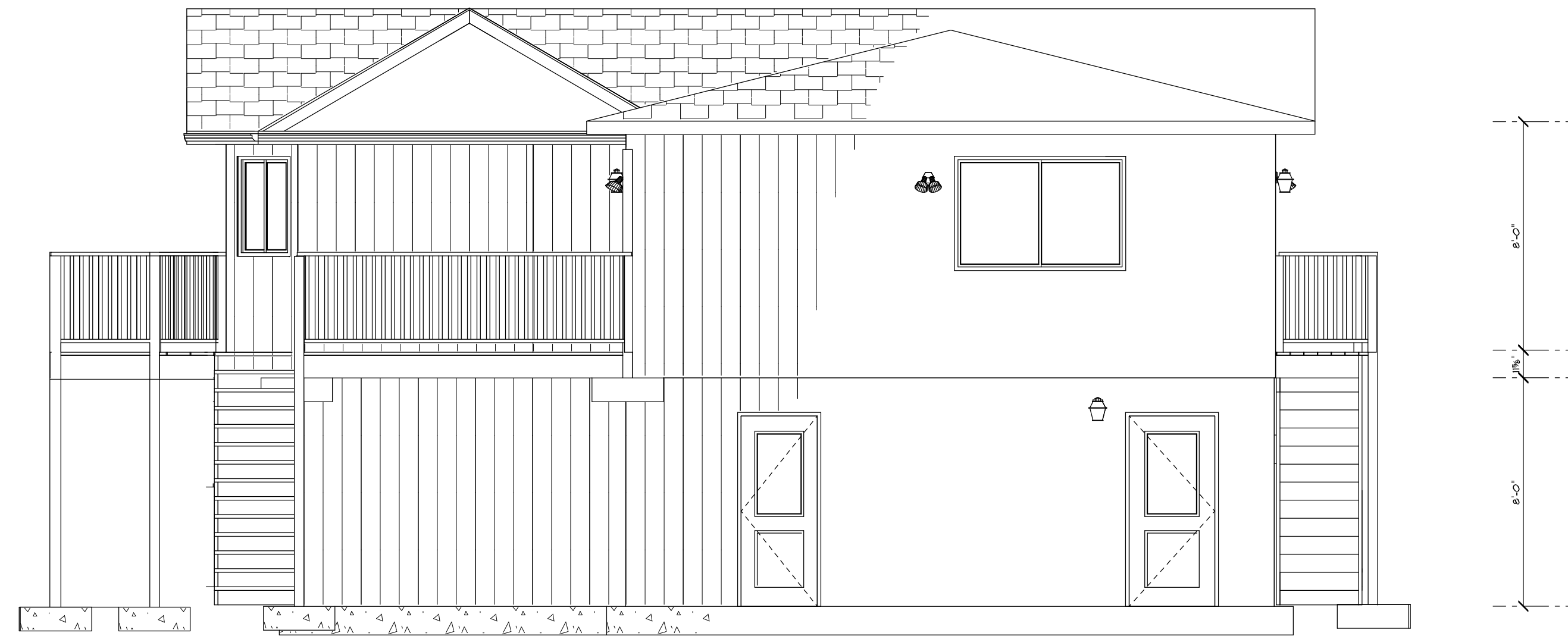
SOUTH ELEVATION SCALE: 1/4" = 1'-0"